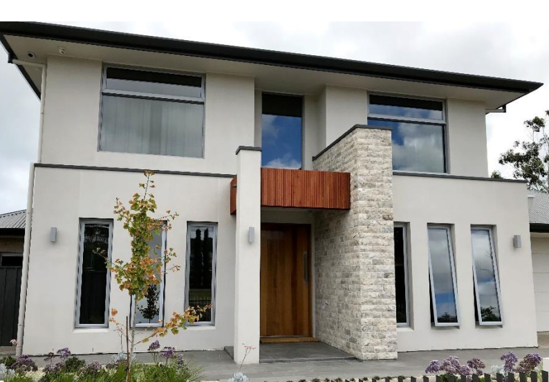
Travertine Silver Pearl Veneers