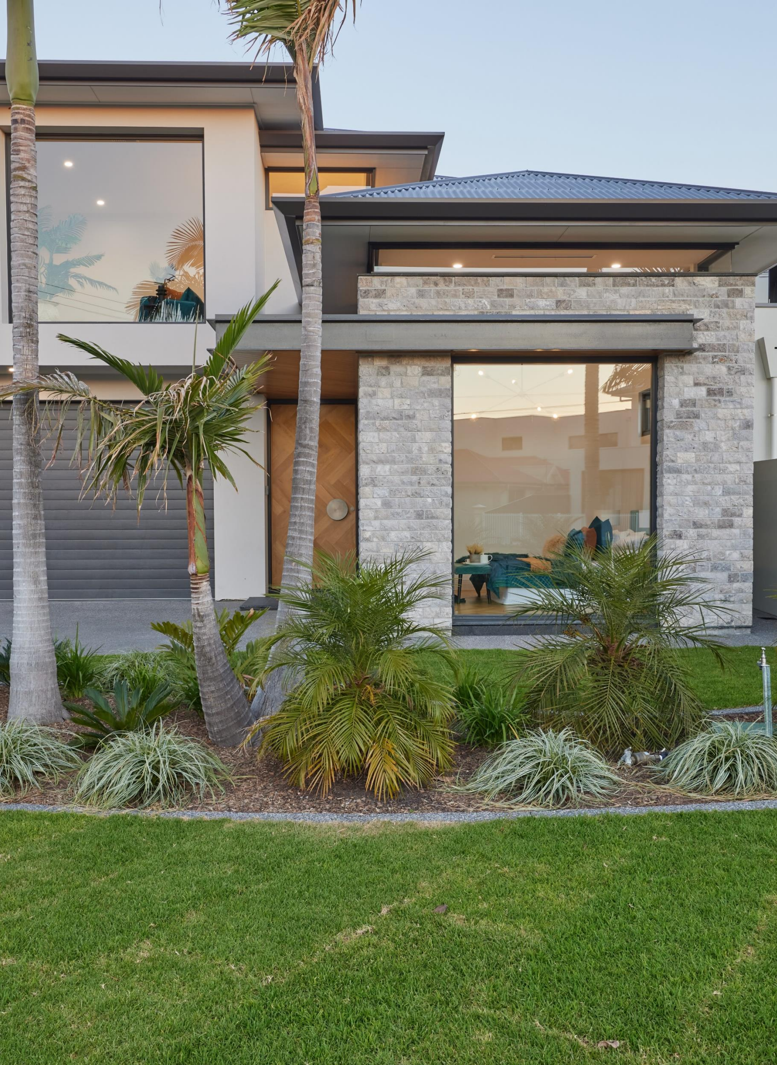
Travertine Silver Pearl Veneers