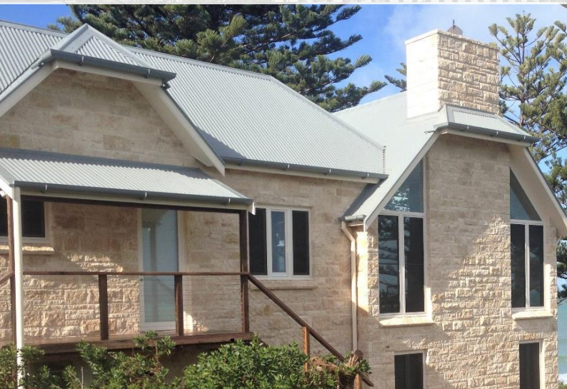
Travertine Sahara Cream Veneers