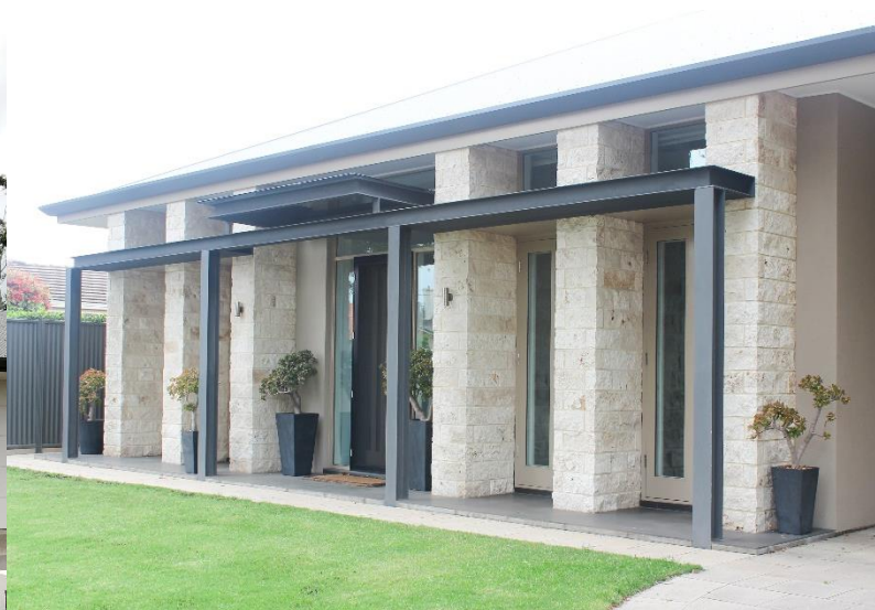
Travertine Sahara Cream Veneers