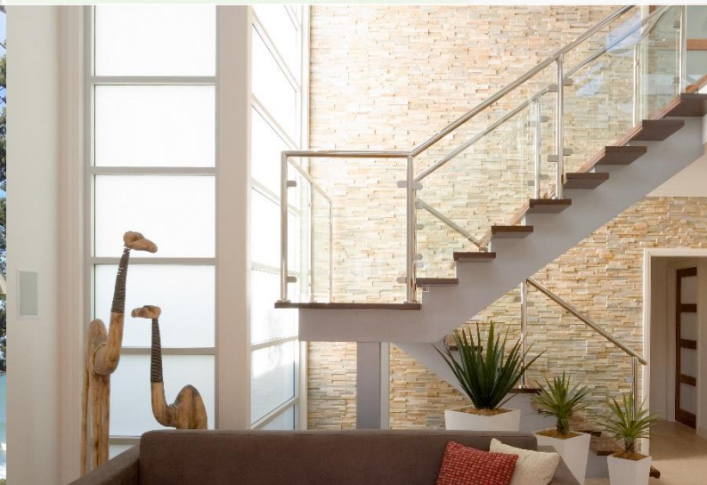
LedgeStone Sunrise Veneers