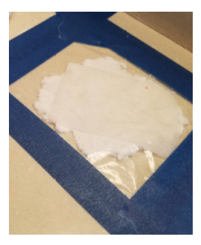
Place damp paper towel. cover & tape air tight