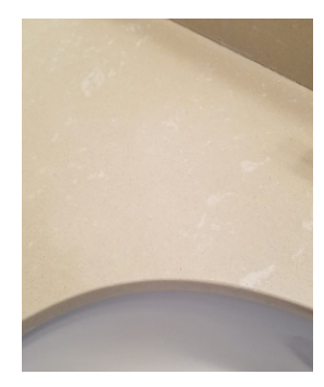
Remove after 24 hours, repeat process for harder stains