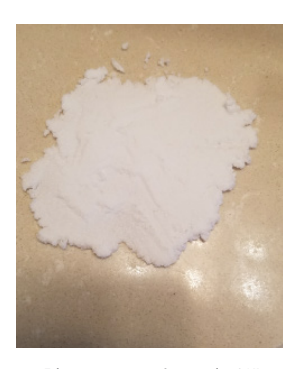
Place approximately 1/4" thick poultice over stain