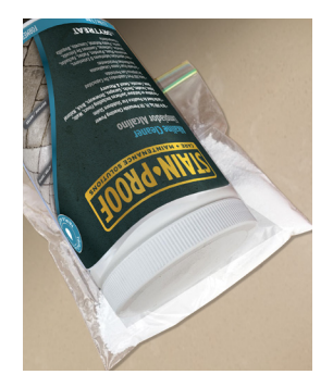
Crush Alkaline Cleaner into a fine powder

1. Place Alkaline Cleaner powder into a plastic bag and crush it into a fine powder by rolling the product container repeatedly over it. 2. Mix powder with water or other liquid to make a paste (on average, 1 scoop of powder mixed with ½ scoop of clean water or other liquid will yield 1 scoop of poultice). Mix should be dry but moist enough to create a paste (the consistency of peanut butter). 3. Place approximately ¼" thick poultice over stain, extending it ½" past the visible stain. 4. Place a damp paper towel on top of poultice, then cover both with a plastic bag, fixing all sides with painter's tape until airtight. 5. Remove after 24 hours. 6. Repeat if necessary. Many stains will come out on the first try, but some stains will require 2-3 poultices.