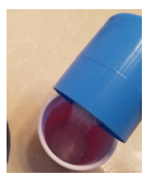
Mix powder with water or other liquid to make a paste