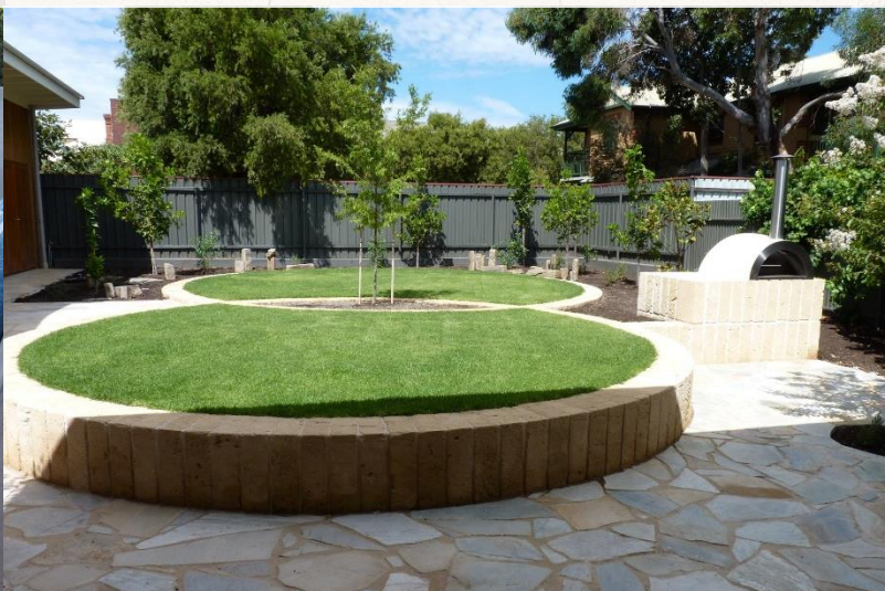
Quartzite Amber Glow Pavers