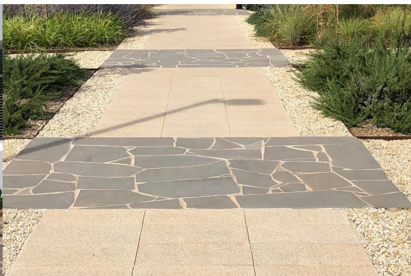
Basalt Dave Grey Pavers