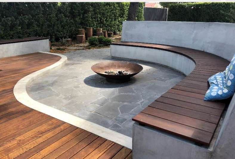
Basalt Dave Grey Pavers