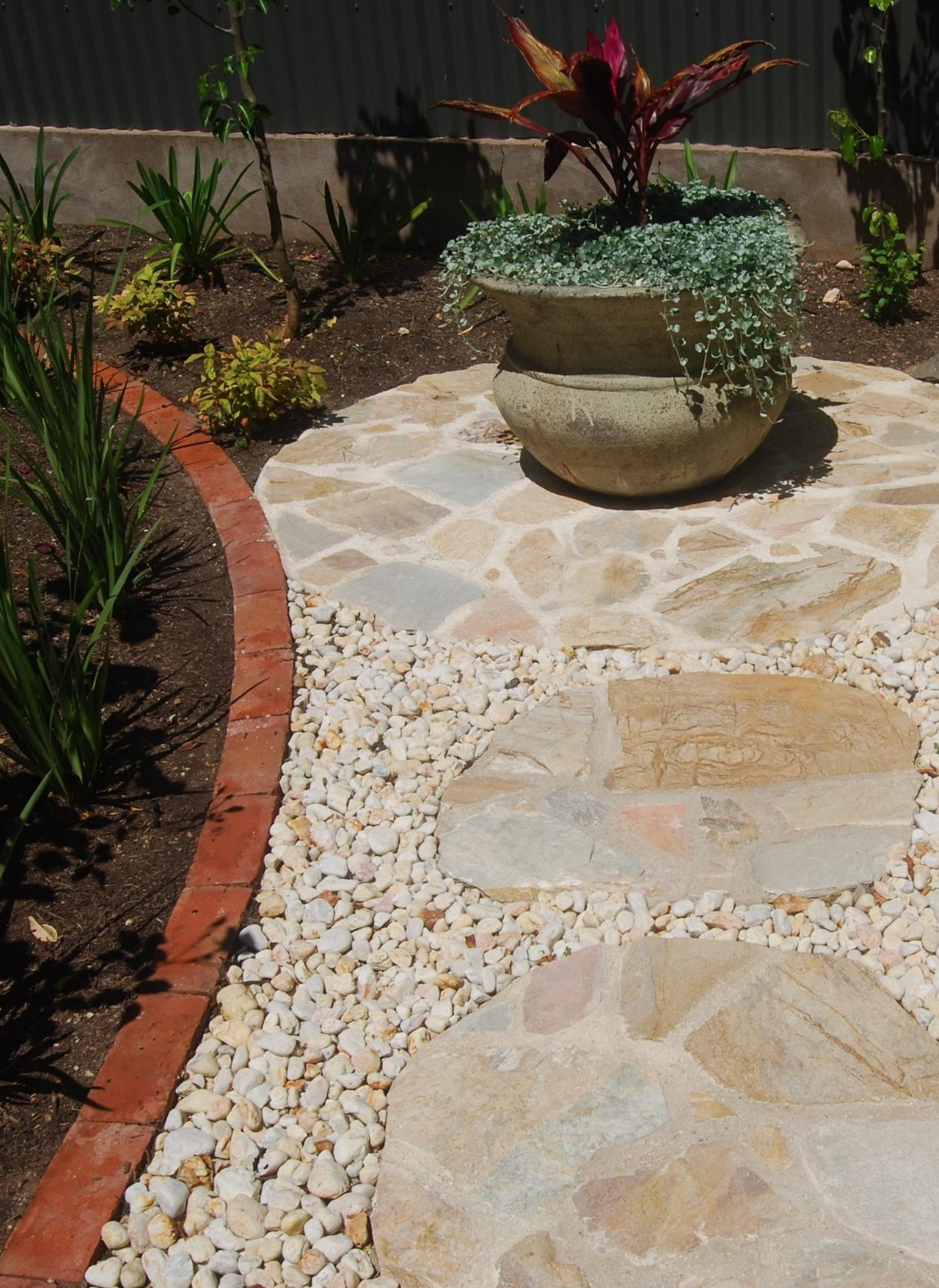
Quartzite Amber Glow Pavers